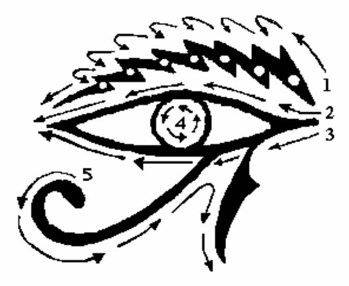
Eye of Melchizedek

The Eye of Melchizedek is drawn and used for the healing of the subtle body and for the clearing of the auras and pranas of the body.